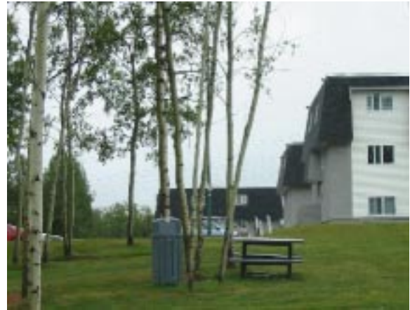
The Cliff Park revitalization project reclaimed the park for residents

impact of the TNRC on the City of Thompson, but also the CED approach that guides the TNRC. At the time of writing this case study, the methodology and indicators used to conduct the evaluation were not publicly available, however, the full report should be available in the early fall of 2005.