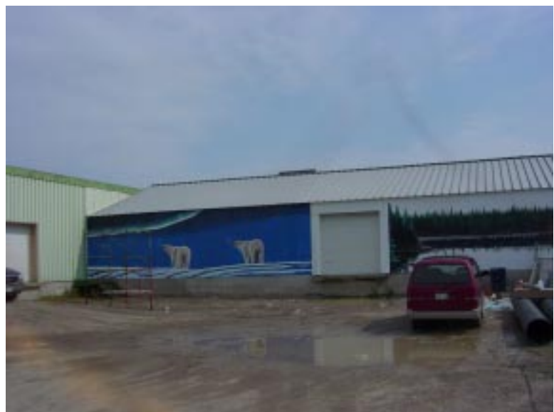
A Neighbourhoods Alive! Mural initiative

TNRC became directly involved in housing initiatives after community consultations identified housing as a priority issue. Some of the initiatives have involved working with landlords and homeowners to improve the condition and aesthetics of the existing housing stock, exploring construction of new housing units, and facilitating the relocation of surplus housing from nearby mining towns. Building on its success as a key player in developing and accessing financing for a 36-unit housing rehabilitation project, TNRC is now working with the YWCA to explore whether an unused community space could be converted into low-income family housing. Ongoing efforts to educate tenants, landlords, and homeowners on their rights and