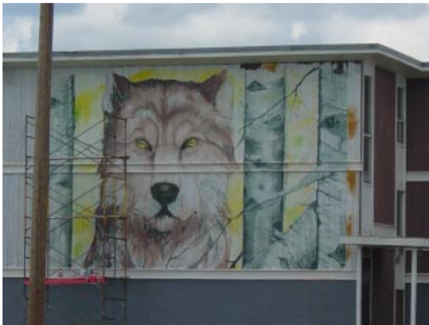
Murals helped spark re-investment in The Pinks

TNRC's intervention was to organize the community in order to reclaim the park. They marked certain trees for removal to thin out the brush, allowing community members to take the wood home for heating. They worked with the City of Thompson to access the Neighbourhood Renewal Fund of NA! to add lights, picnic tables and garbage cans, put down new sod and tidy up the area. In winter, a small skating oval is created there as well. A nearby landlord got into the action by re-painting the housing complex. Now, says Stewart, the only thing